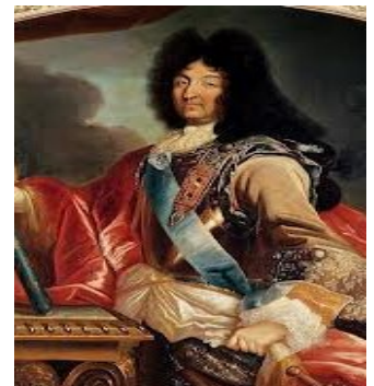
LOUIS XIV OF FRANCE IN THE THRONE.

turned the testament of Louis XIII in the Parliament, she broke with the advice and became the only ruler. During his regency, he trusted power to his prime minister, the Italian Cardinal Mazarin, the most competent French political circles for his non-French origin.